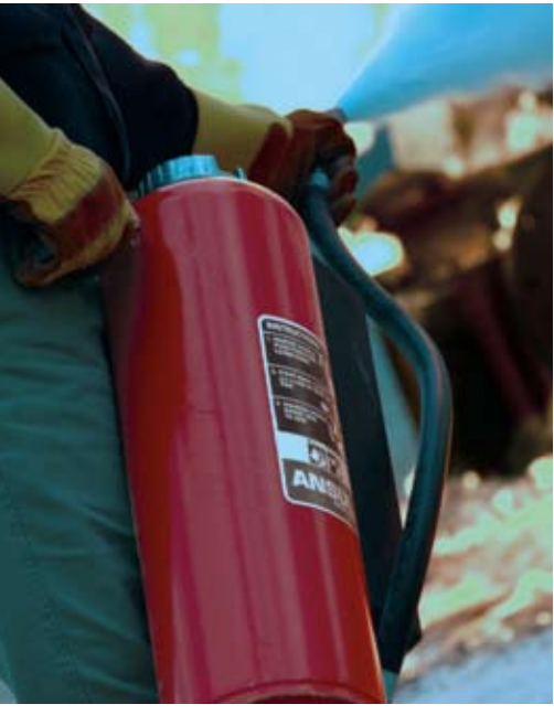
PORTABLE FIRE EXTINGUISHERS

We just can't leave things alone — not exactly a vice when it comes to perfecting the science of fire protection. And since ANSUL portable fire extinguishers were introduced more than 65 years ago, we've never stopped designing, refining and bringing new models to market. Today, no matter which ANSUL portable you choose, you can be certain it will excel at two jobs: ensuring you get to the fire as quickly as possible and performing once you're on the scene.